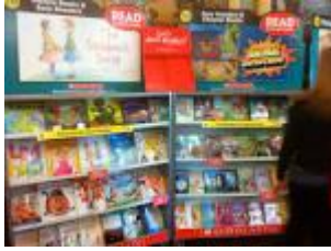
The Book People Book Fair