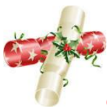
Children's Christmas Fair - Friday 7 th December - 1.00 - 3.00pm

On Monday 3 rd December the school Christmas Post Box will open. If your child wishes to send Christmas cards to their friends then please ensure each card has the child's name AND class clearly written on it. Unfortunately every year, some cards do not make it to their desired recipient due to omission of details. Please place them in your child's book bag and they will have the opportunity to post them during the day.